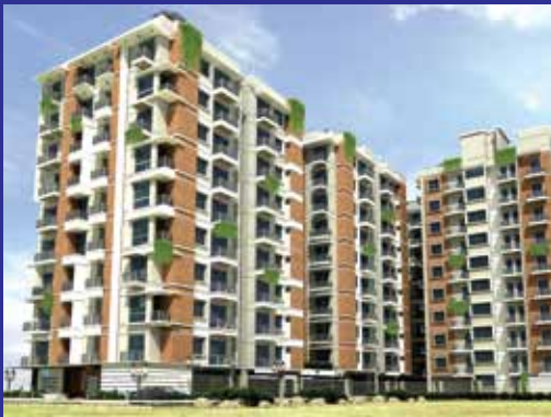
Regent Parbata Grand @ Mirpur-10 Luxurious Condominium Residential Project of 126 Apartments 10-Storeyed Residential Building with basement Land Size: 35.0 Katha Handover in 4.5 years