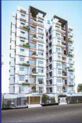
Regent Palace @ Adabor, Mohammadpur 10-Storeyed Residential Building Land Size: 10.0 Katha Land