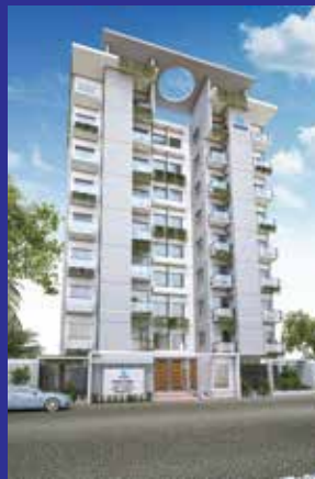
Regent Jannat @ Aftabnagar R/A 9-Storeyed Residential Building Land Size: 6.0 Katha