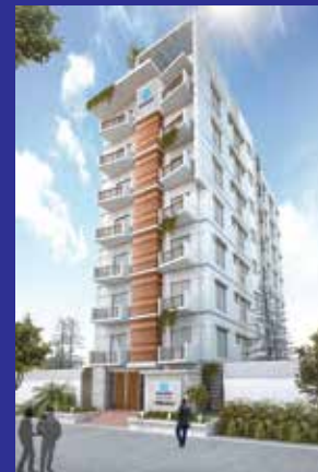
Regent East Queen @ Nurur Chala 8-Storeyed Residential Building Land Size: 5.0 Katha