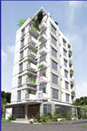
Regent South Lake @ Hatirjheel 7-Storeyed Residential Building Land Size: 3.50 Katha Handover in 1.5 Years