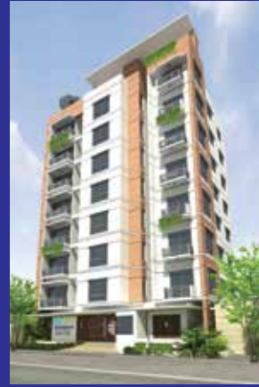
Regent South Pearl @ Khilgaon 8-Storeyed Residential Building Land Size: 5.0 Katha Handover in 2.0 years