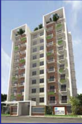
Regent Sufia @ West Agargaon 10-Storeyed Residential Building Land Size: 6.0 Katha Handover in 2.0 years