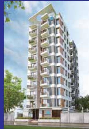
Regent Islam @ North Badda 10-Storeyed Residential Building Land Size: 6.0 Katha