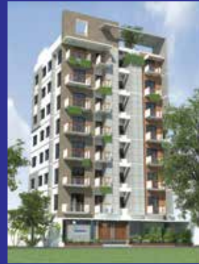
Regent East Castle @ North Badda 8-Storeyed Residential Building Land Size: 5.0 Katha Land Handover in 2 Years